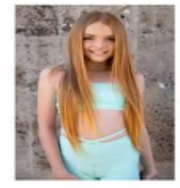
Applicants must be 4 years of age and a maximum of 15 years of age. Age as at January 1st 2022 you must be a legal resident of Australia or New Zaalan