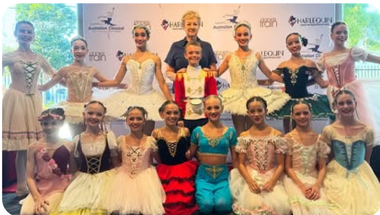
2025 PRE-INTERMEDIATE CLASSICAL FINALISTS NEWCASTLE EVENT

12:30-2PM PRE-INT DEFILÉ REHEARSAL 4PM FINALS COMMENCE