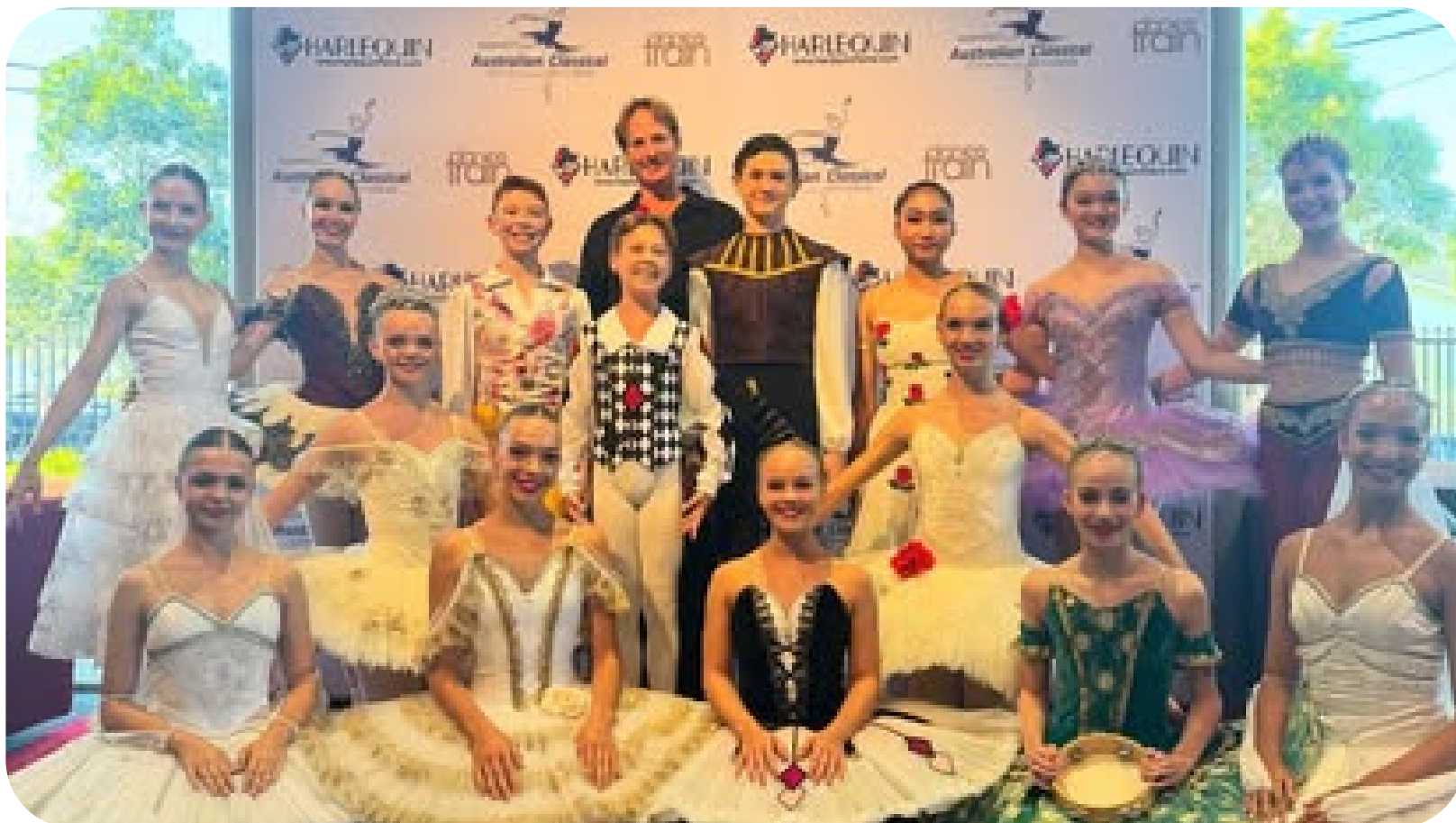
2025 INTERMEDIATE CLASSICAL FINALISTS NEWCASTLE EVENT