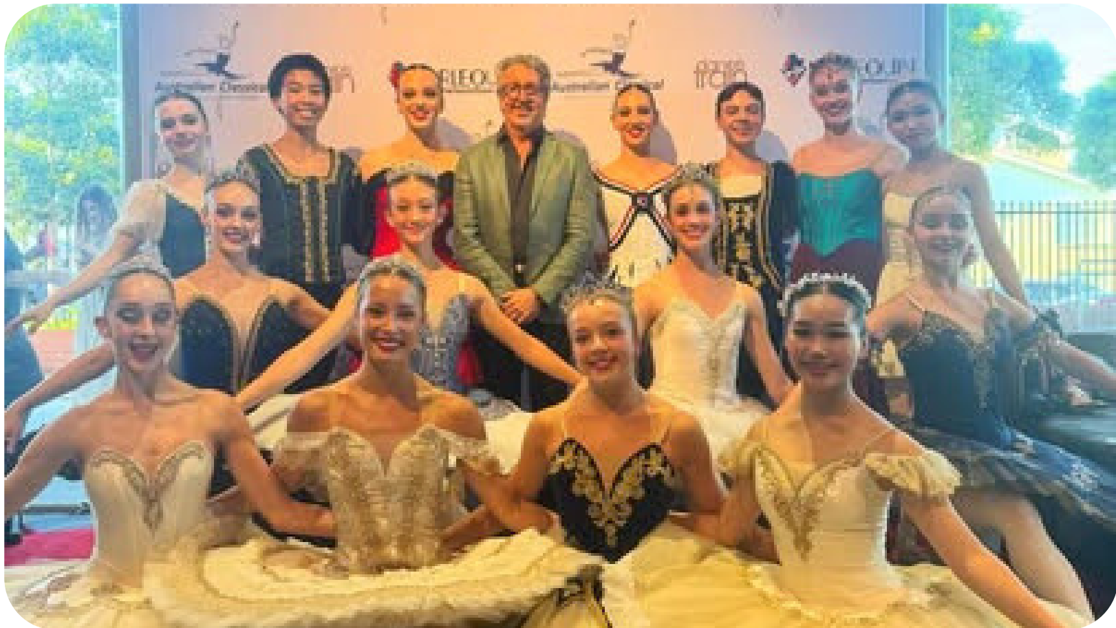
2025 SENIOR CLASSICAL FINALISTS NEWCASTLE EVENT

2-3PM SENIOR DEFILÉ REHEARSAL 4PM FINALS COMMENCE