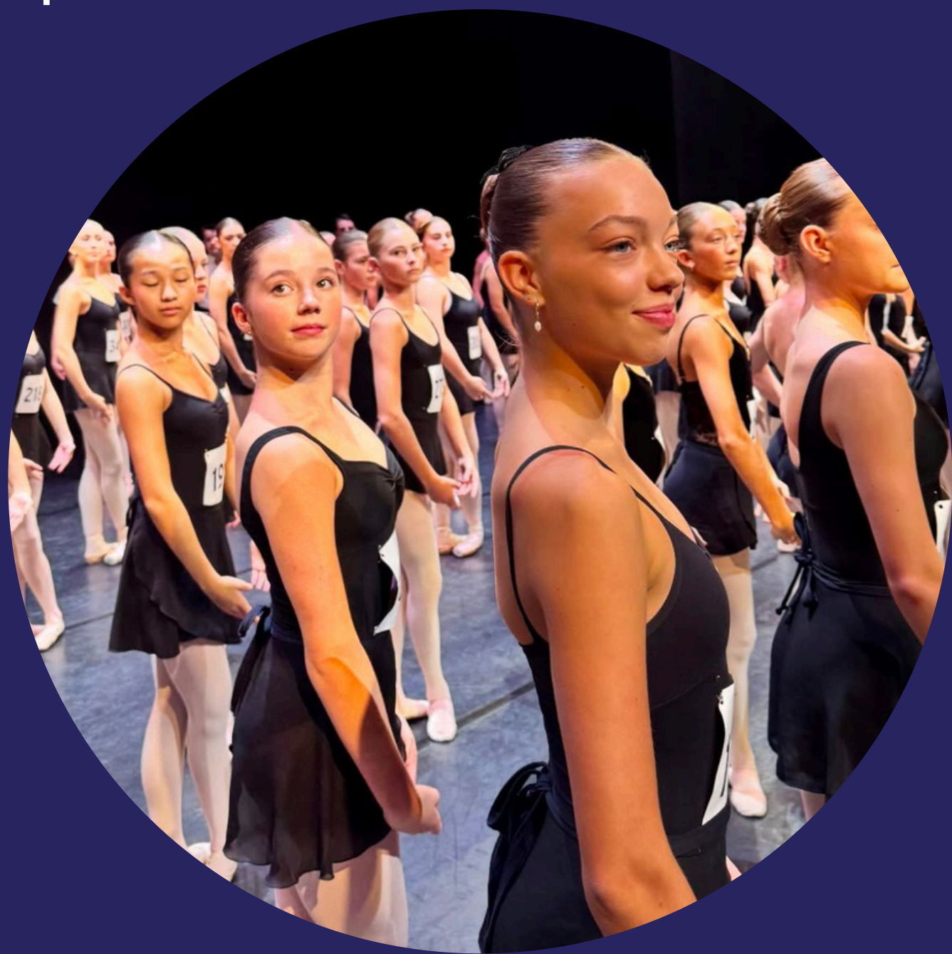
GRANDÉ DÉFILE REHEARSAL 2025