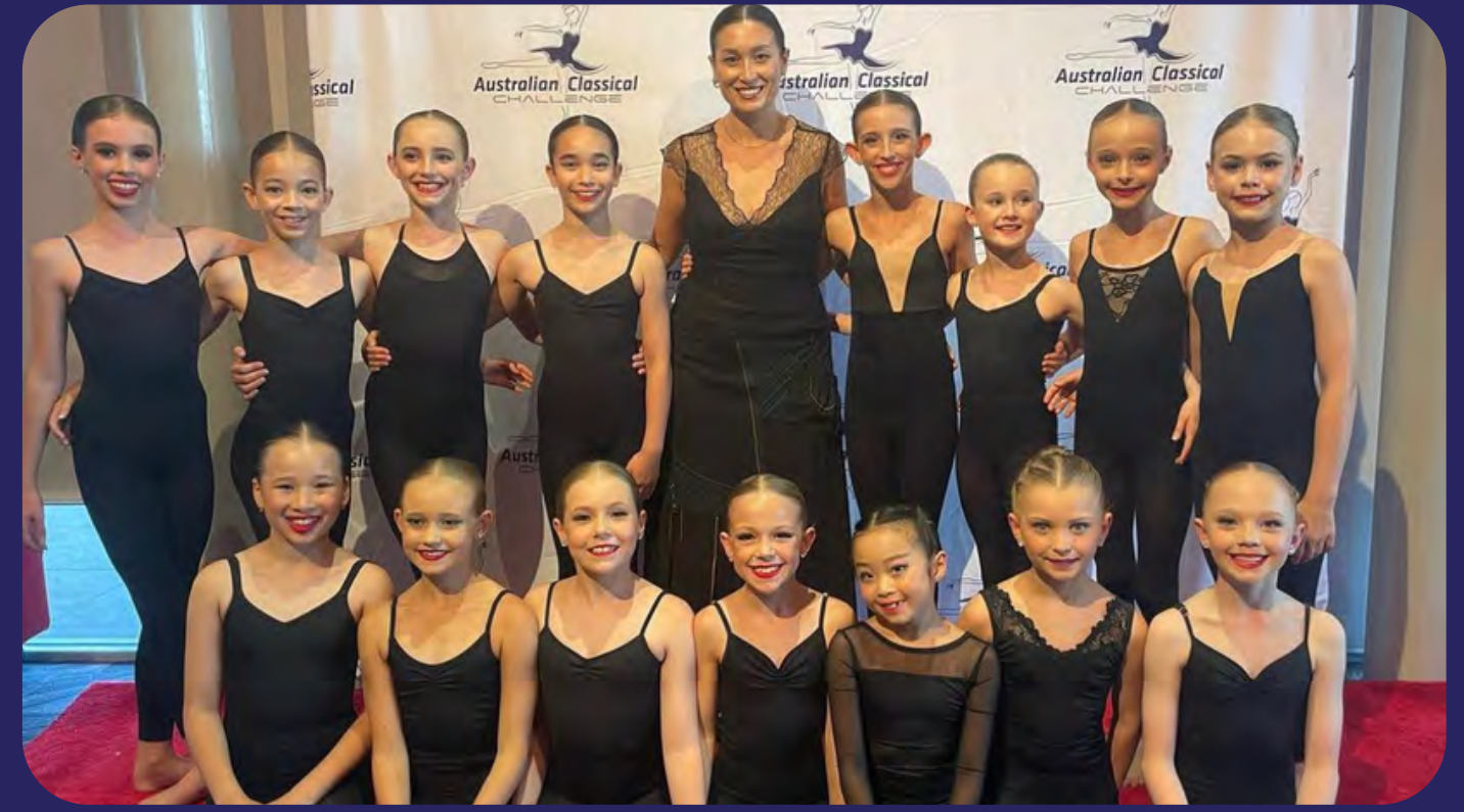
2023 JUNIOR CONTEMPORARY FINALISTS