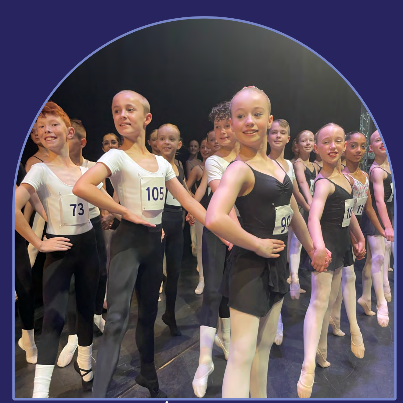
GRANDÉ DEFILE REHEARSAL 2023