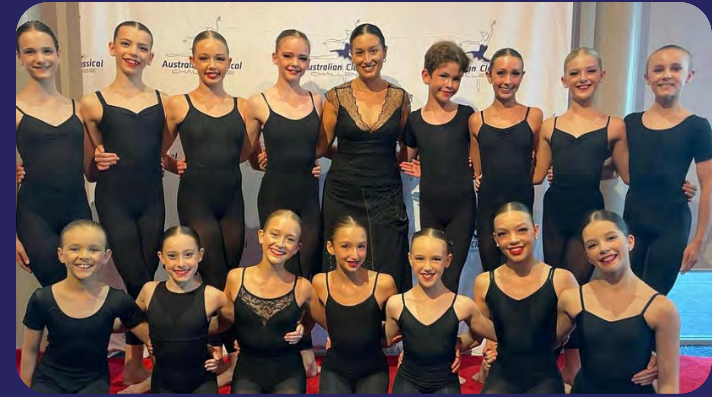
2023 PRE-INTERMEDIATE CONTEMPORARY FINALISTS