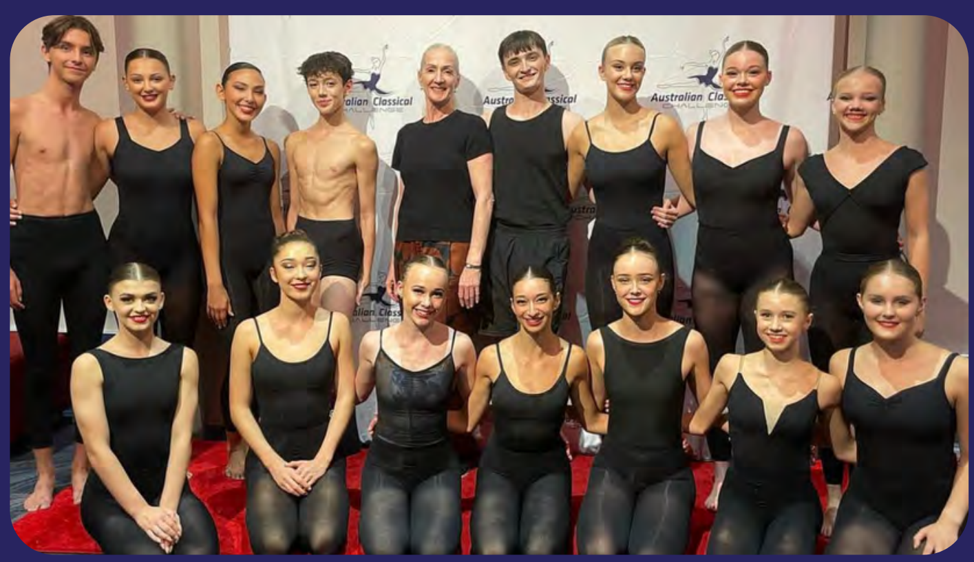
2023 SENIOR CONTEMPORARY FINALISTS