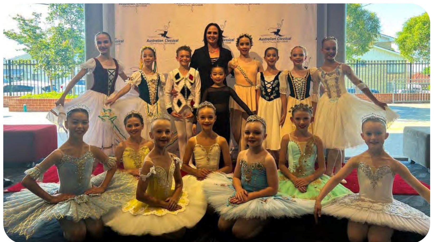
2023 PRE-INTERMEDIATE CLASSICAL FINALISTS NEWCASTLE EVENT