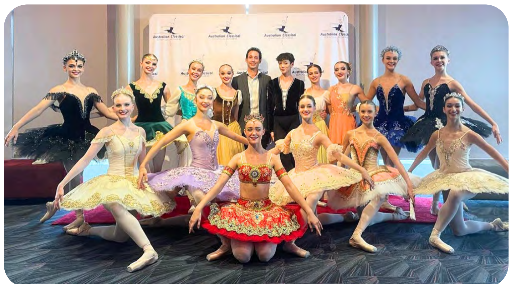
2023 SENIOR CLASSICAL FINALISTS NEWCASTLE EVENT