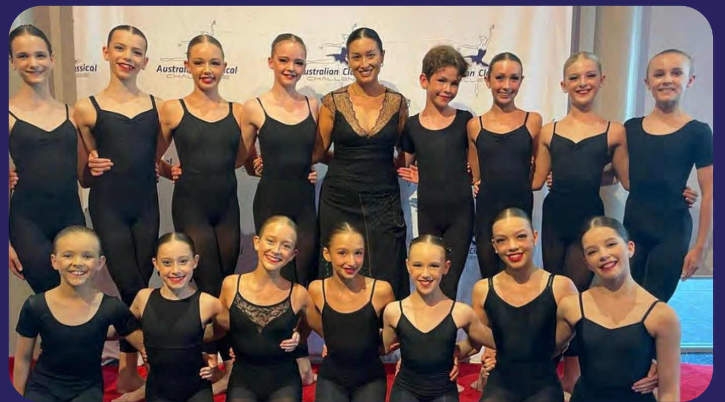
2023 PRE-INTERMEDIATE CONTEMPORARY FINALISTS