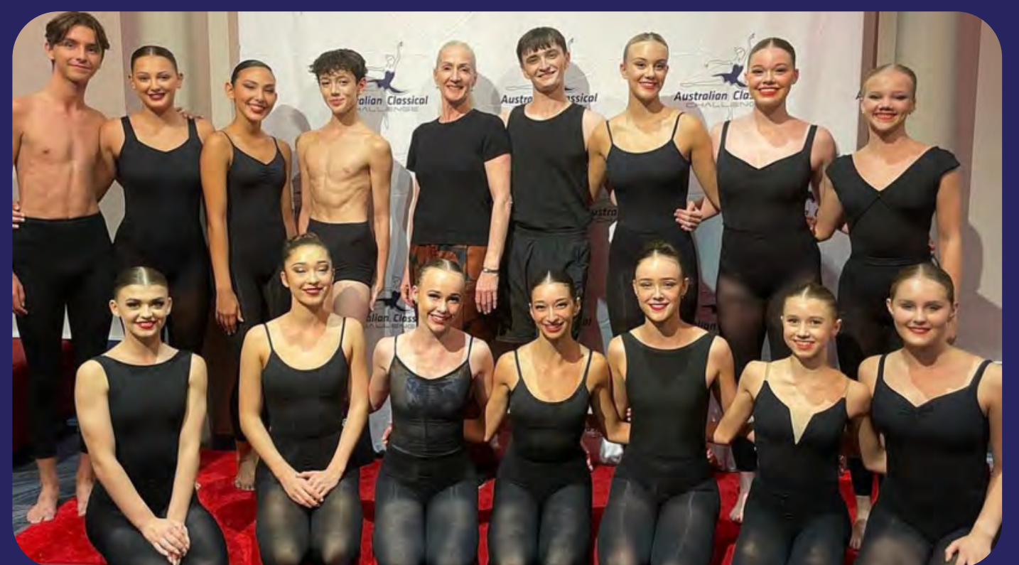
2023 SENIOR CONTEMPORARY FINALISTS