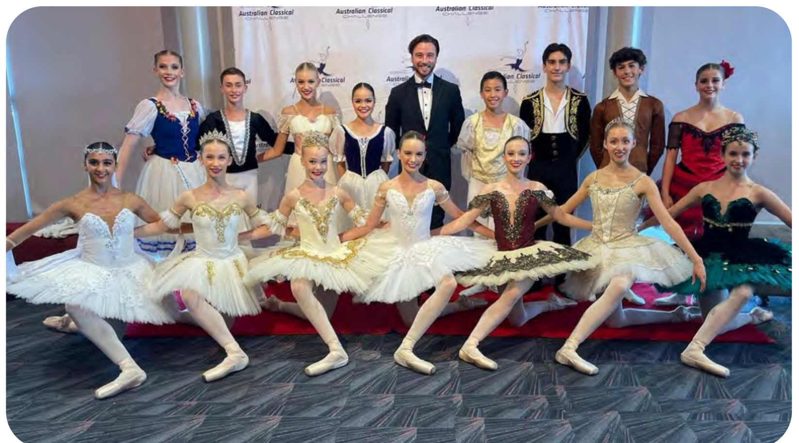
2023 INTERMEDIATE CLASSICAL FINALISTS NEWCASTLE EVENT