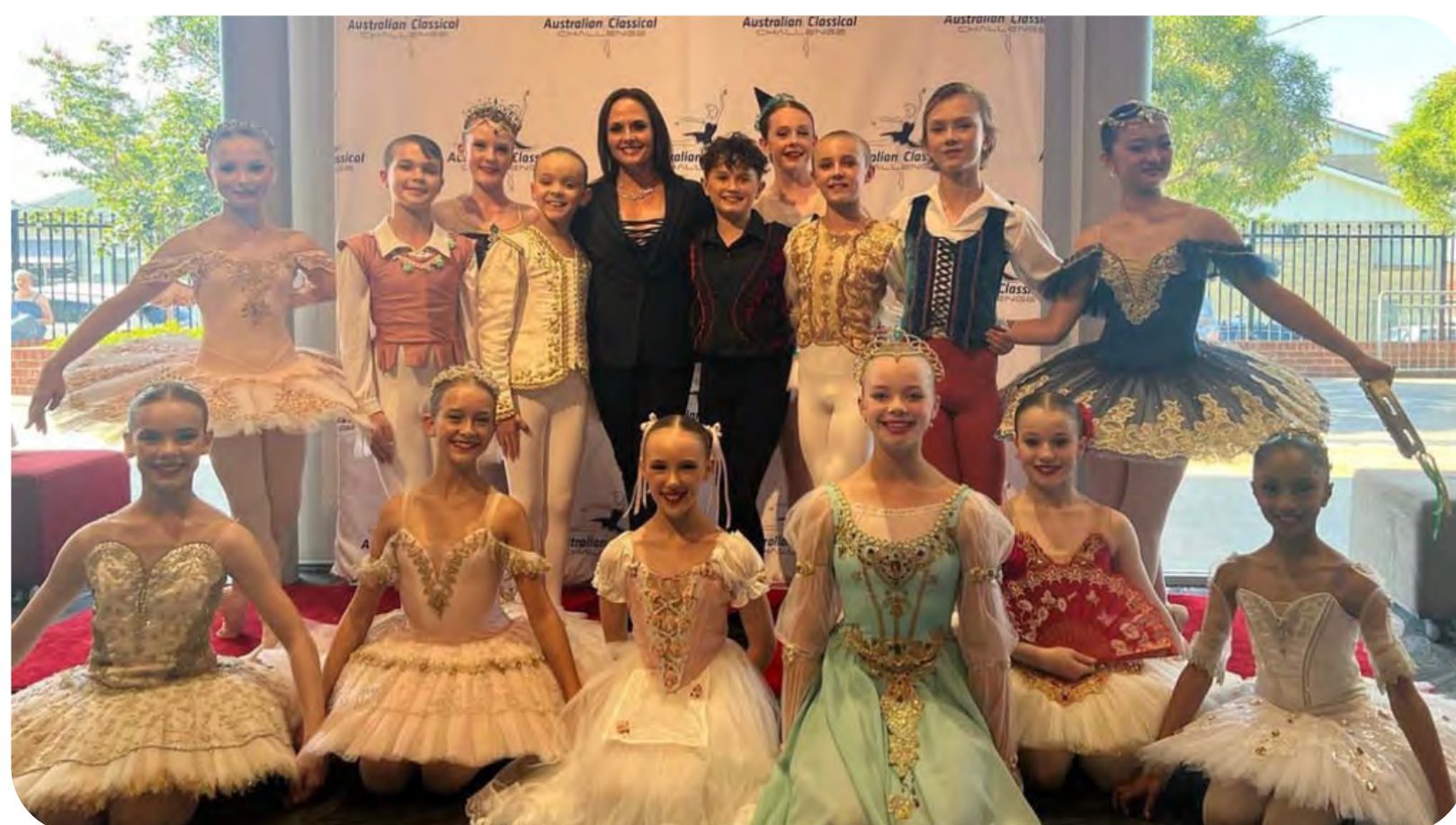
2023 JUNIOR CLASSICAL FINALISTS NEWCASTLE EVENT