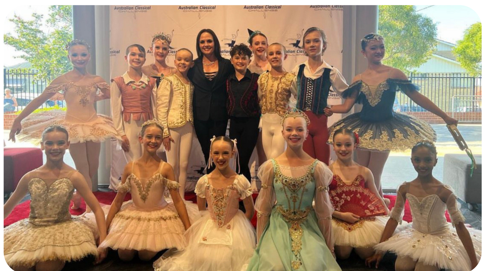
2023 JUNIOR CLASSICAL FINALISTS