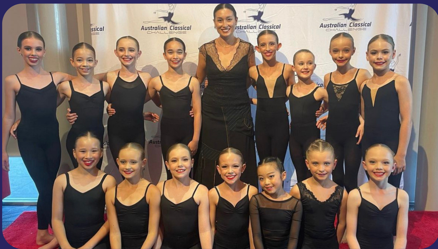
2023 JUNIOR CONTEMPORARY FINALISTS