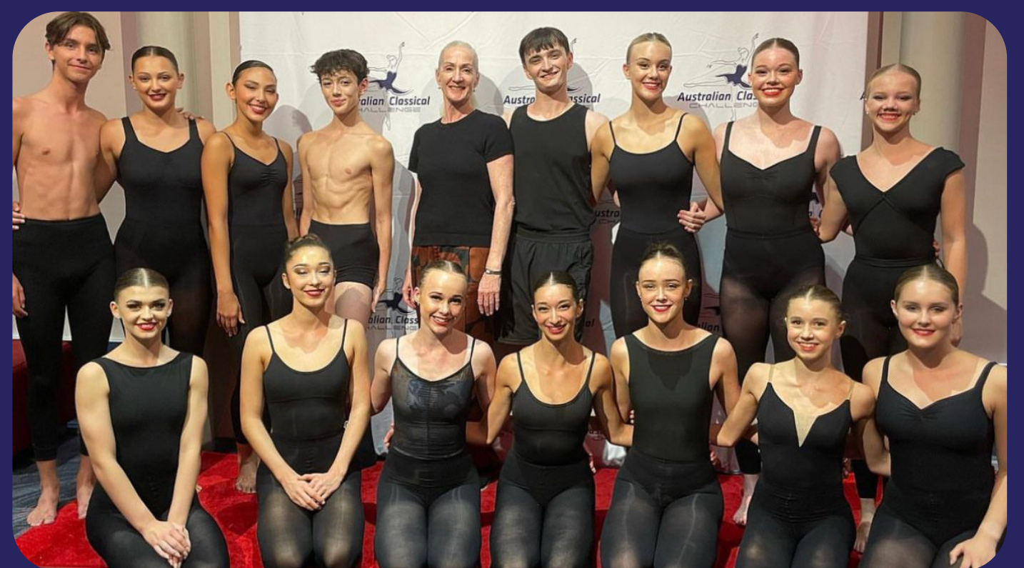
2023 SENIOR CONTEMPORARY FINALISTS