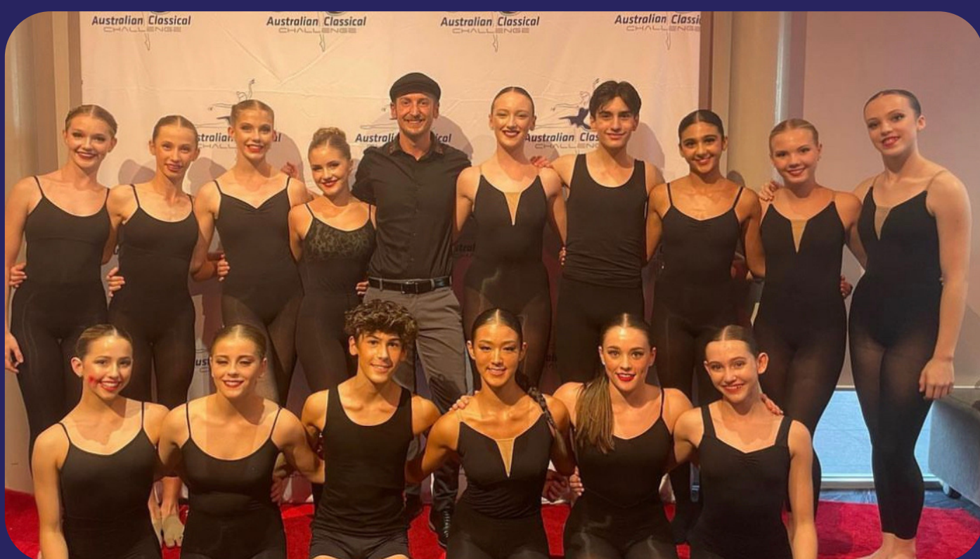
2023 INTERMEDIATE CONTEMPORARY FINALISTS