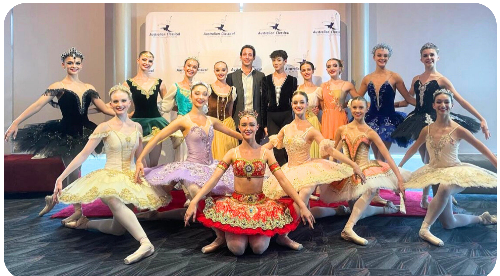
2023 SENIOR CLASSICAL FINALISTS