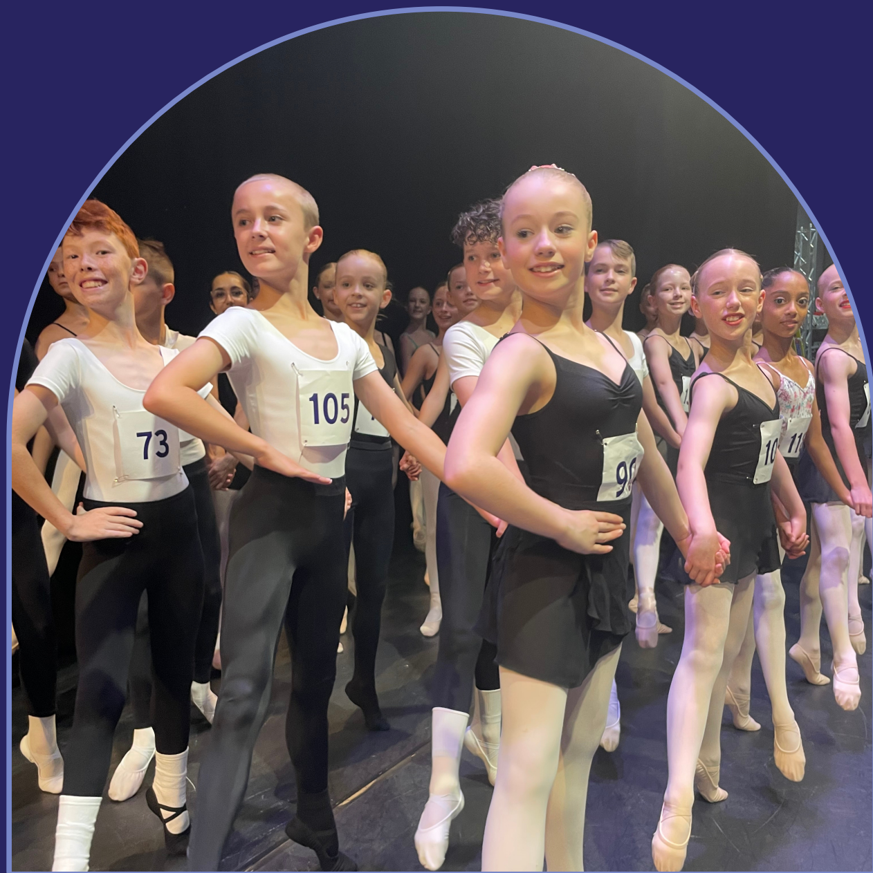
GRANDÉ DEFILÉ REHEARSAL 2023