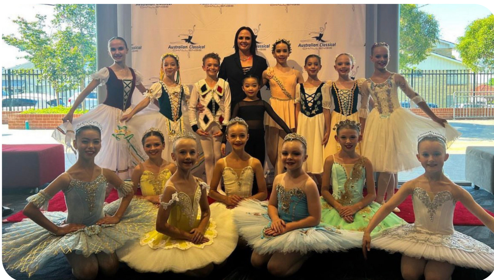
2023 PRE-INTERMEDIATE CLASSICAL FINALISTS