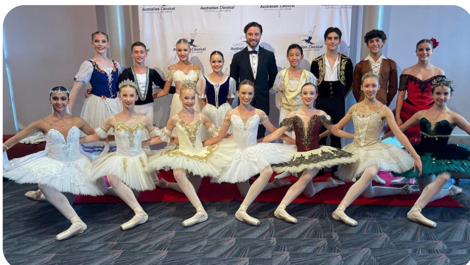
2023 INTERMEDIATE CLASSICAL FINALISTS