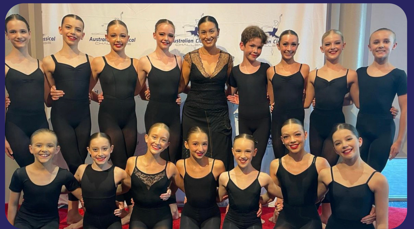
2023 PRE-INTERMEDIATE CONTEMPORARY FINALISTS